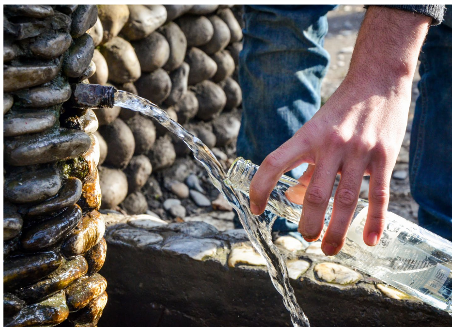
Water is collected from local drinking water points for testing. It may look clear this time, but it is important to know for certain that it is safe to drink.

After learning about staying healthy and protecting the environment through World Vision workshops, the next logical step for members of the youth Eco club in Kakheti, Georgia, was taking social action about their local water quality.