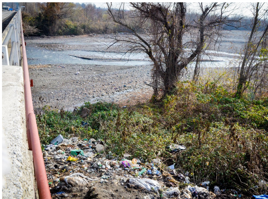
A local government-established landfill has contaminated drinking water in Kakheti.